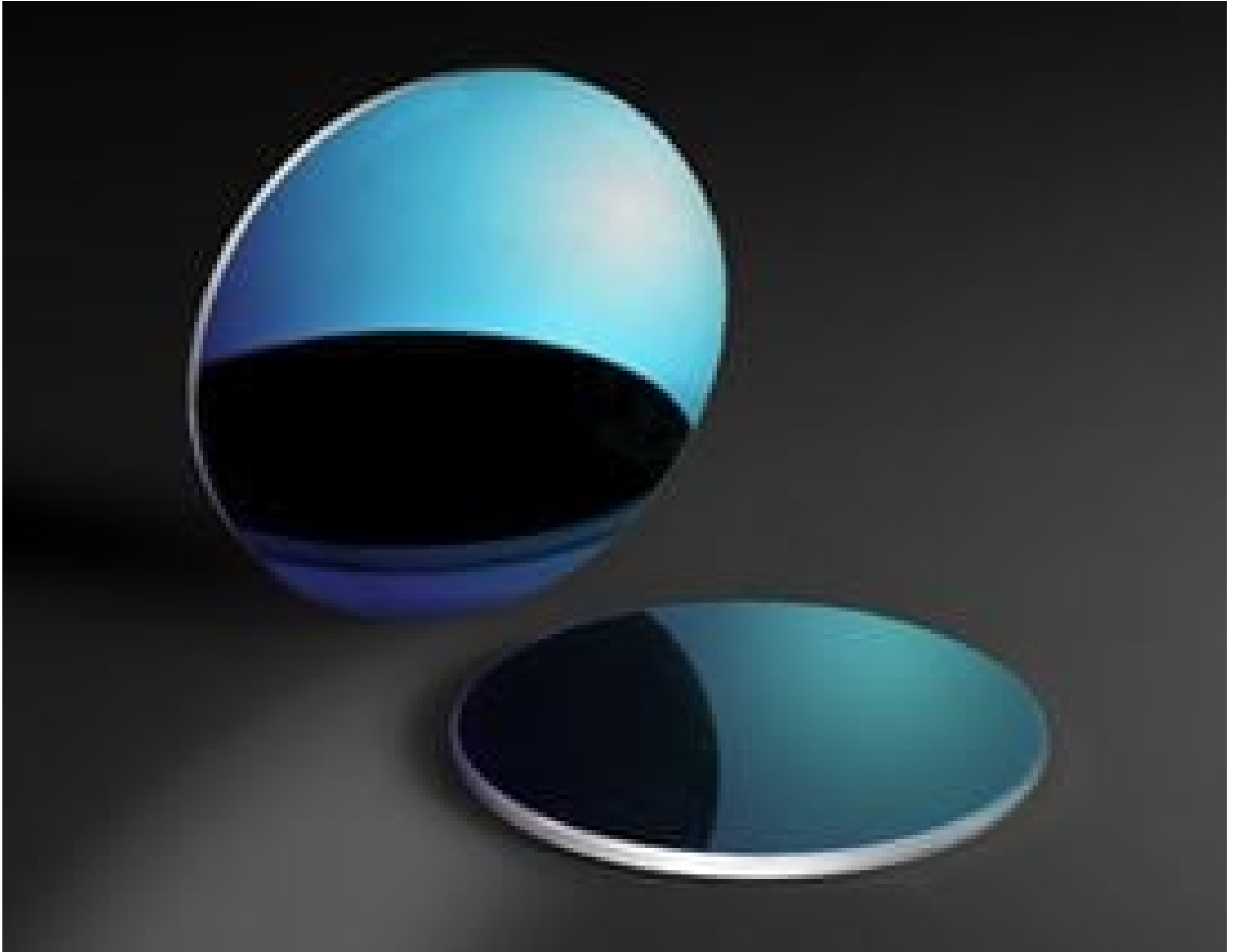
Infrared (IR) Neutral Density (ND) Filters