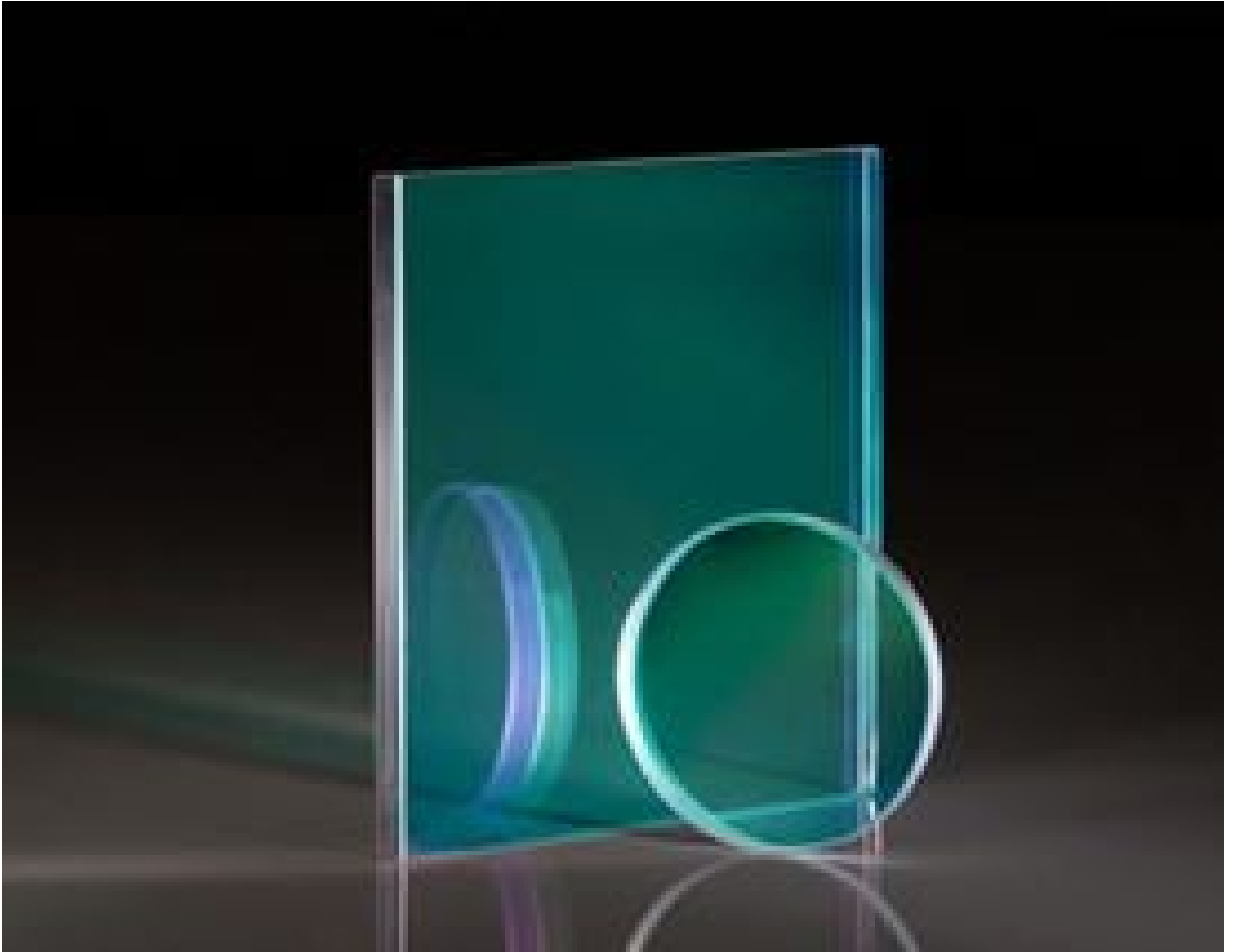
UV Hot Mirrors