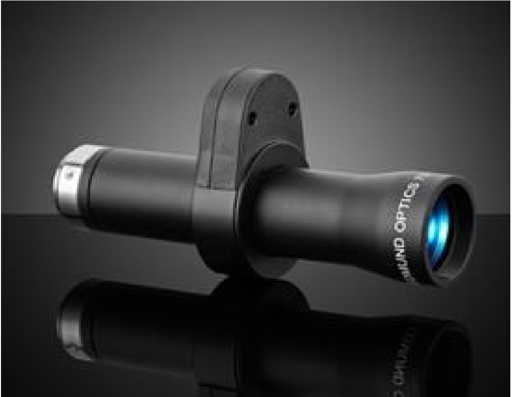
0.75X MercuryTL™ Liquid Lens Telecentric Lens