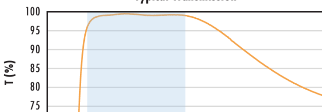
N-BK7 with VIS-EXT Coating Typical Transmission

Typical transmission of a 3mm thick N-BK7 window with VIS-EXT (350-700nm) coating at 0° AOI.