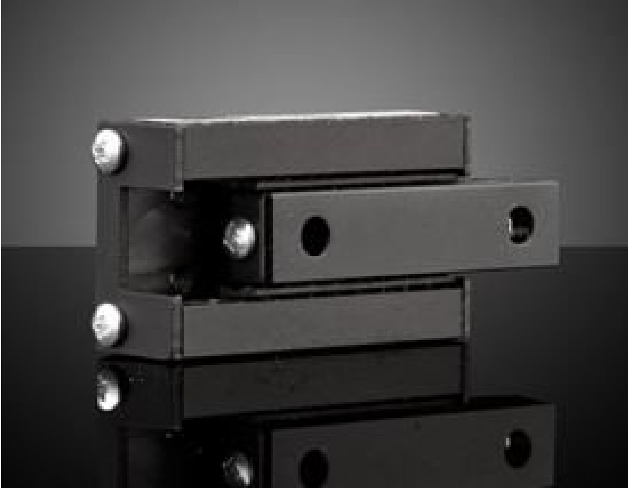
0.5" Travel, 1.12"L x 0.59"W Ball Bearing Slide, #53-849