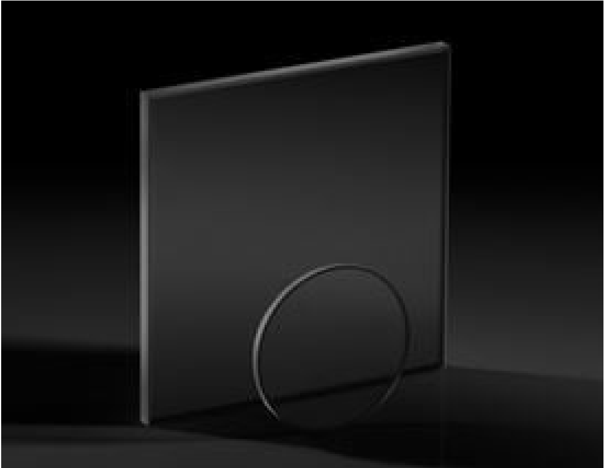
Precision Absorptive Neutral Density (ND) Filters