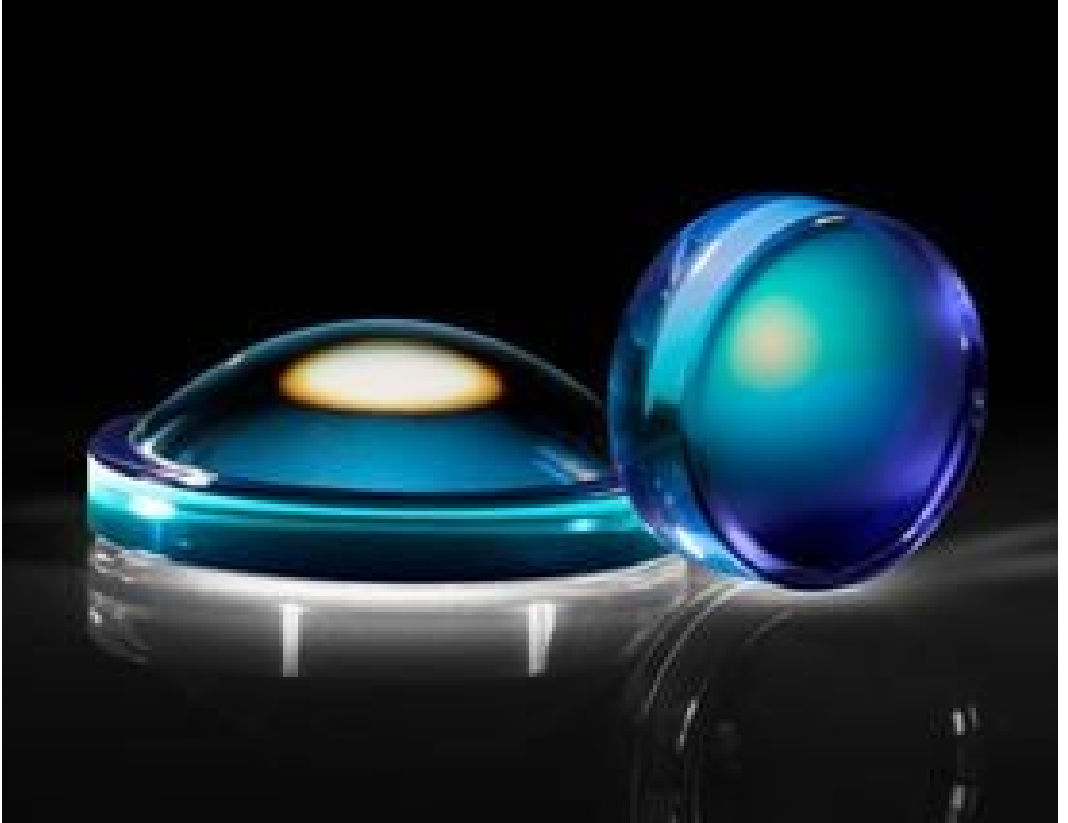
Precision Molded Aspheric Lenses